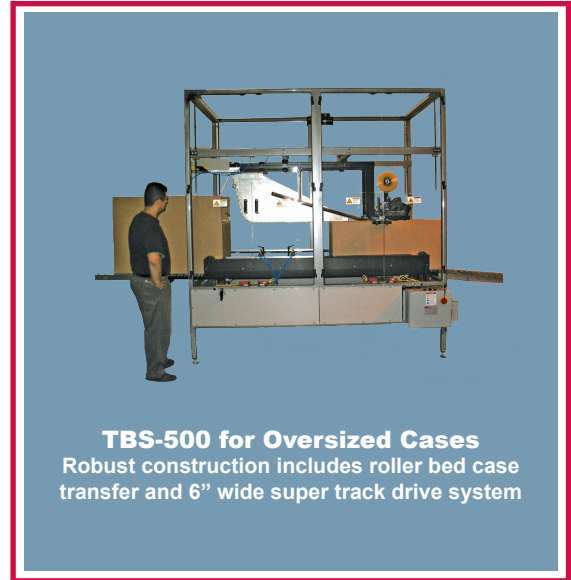
TBS-500 for Oversized Cases Robust construction includes roller bed case transfer and 6" wide super track drive system