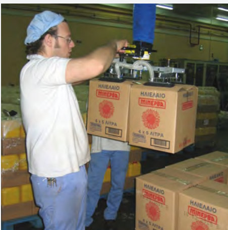
3. Twin box lifter, special suction foot 2699.