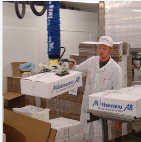
2. Food industry have been using vacuum lifters to handle boxes in the cold packaging area for many years.