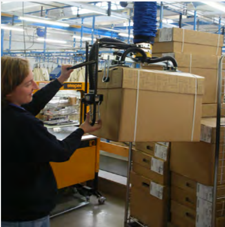
1. Flexible, extended handle turns "over-the-shoulder"-lifting into ergonomic lifting.